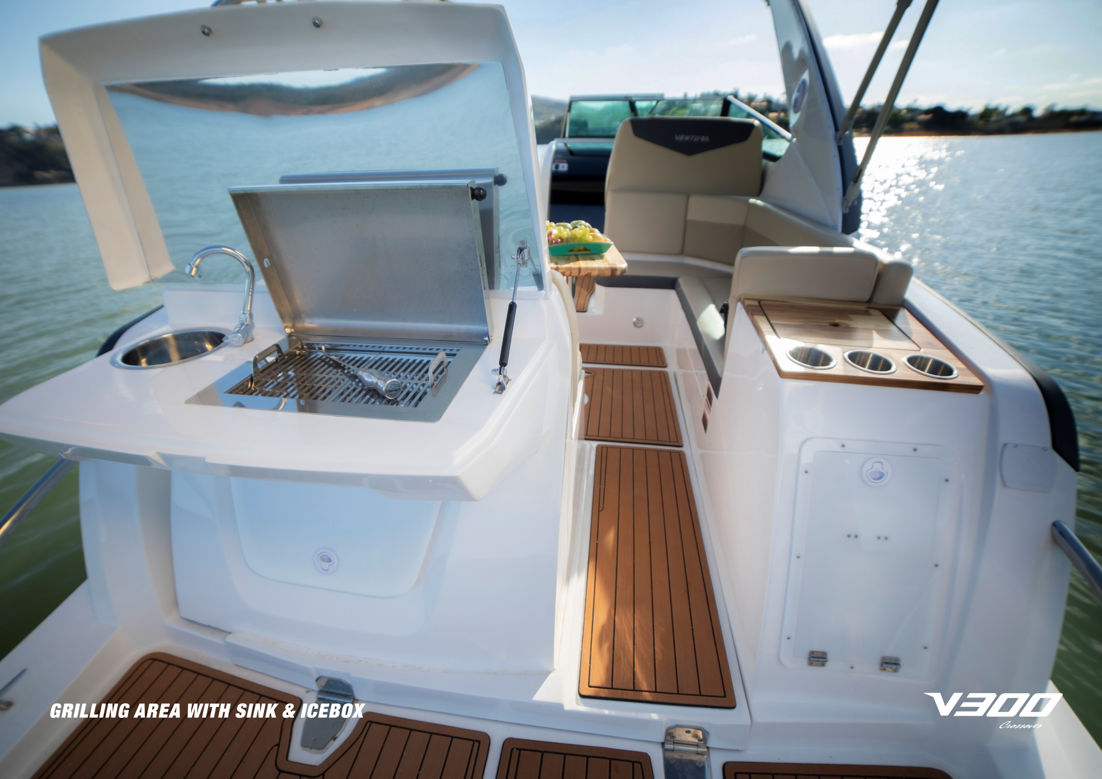
GRILLING AREA WITH SINK & ICEBOX