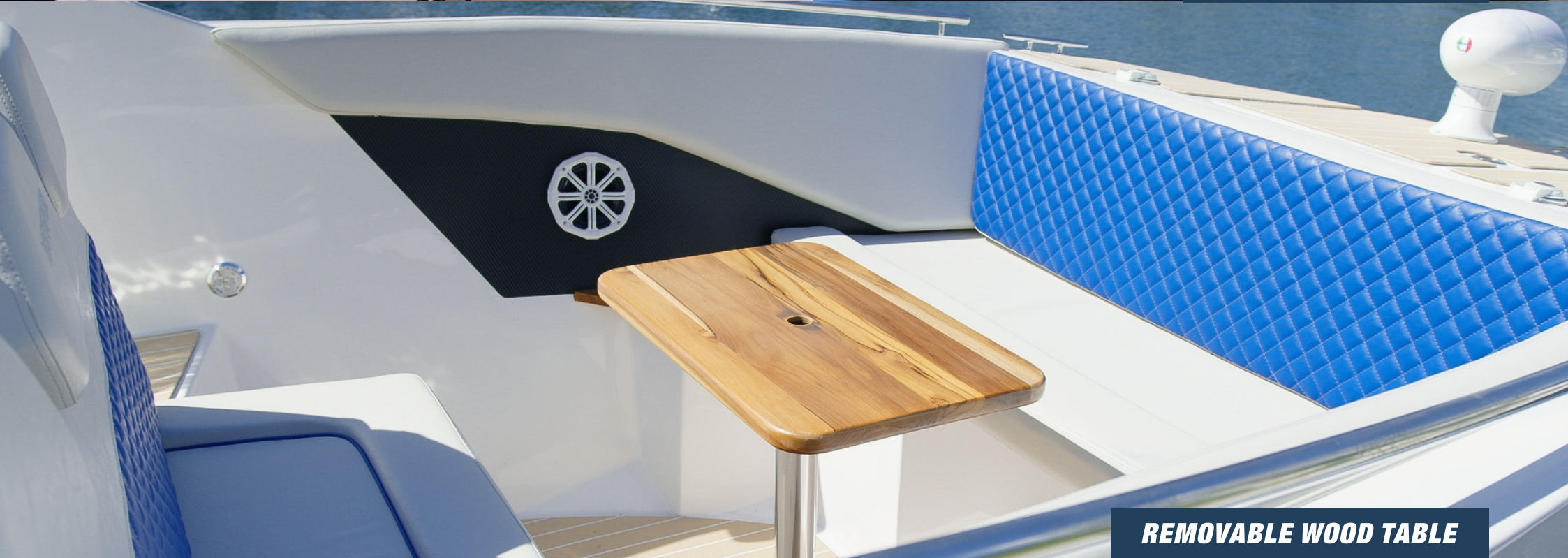
REMOVABLE WOOD TABLE